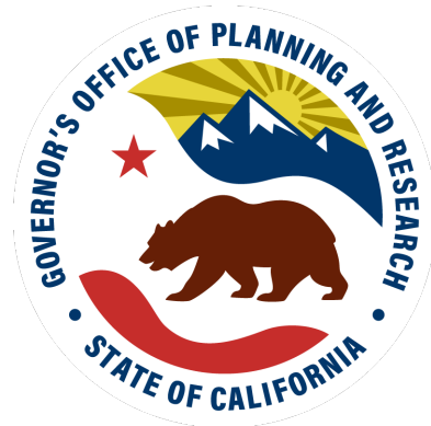
OPR WEEKLY FEDERAL GRANTS E-LIST