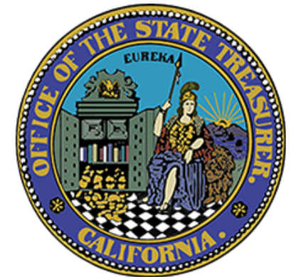
STATE TREASURER'S OFFICE PROGRAMS