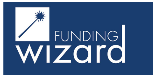
CARB FUNDING WIZARD