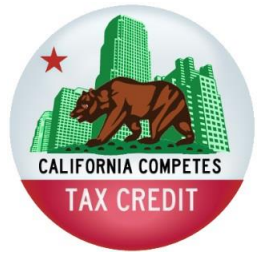
EXHIBIT B FIRST AMENDMENT TO AGREEMENT